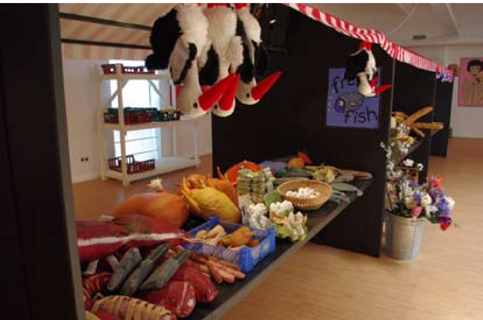
The cloth shops

There will be the opportunity to gain accreditation for this work if people want this. But these workshops are good fun. Younger children can take part. Parents will also be invited to help with set up and the running of the event itself. There are many skills to be explored and experienced and the Big Wide Talk team will be work with everyone who wants to take part.