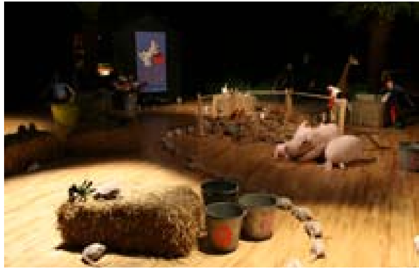
The Cloth Farmyard

The Cloth Place will provide a space in which children do things under their own direction that excite them and provoke intense learning. Adults - both parents and practitioners - will be able to observe the children and share the experience in reflective sessions afterwards. Big Wide Talk will set up and service the space as well as film the children in action. A mobile edit suite will be provided on site so that parents and practitioners will be able to view the footage of the children, making clips and talking through what the children say and do. Children will also be able to work with Big Wide Talk to edit their own footage and make their own movies.