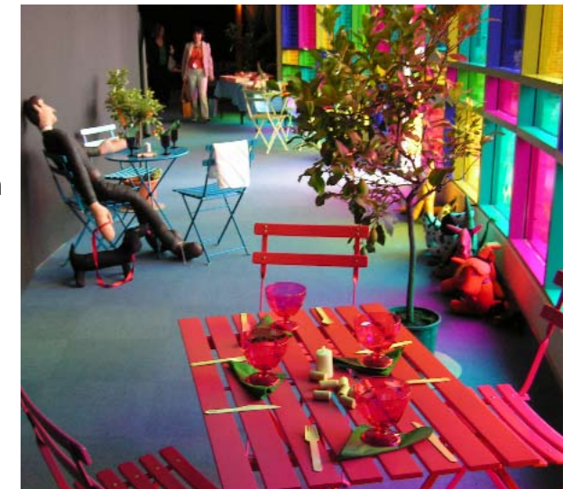
The Cloth Cafe

Filming is an important element of our work and, with suitable permissions, we will film in The Cloth Place. All adults will be invited to view footage relevant to their children at our documentation centre using our Mobile Edit Suite, within two hours of their child having attended. We intend to make a film as the final document for this work, incorporating the dialogue between children and adults and the way this vital interaction shapes the future. The film will focus on some of the social constructions, fairness; justice; collaboration, sharing and so on, which we know the children are actively engaged in.