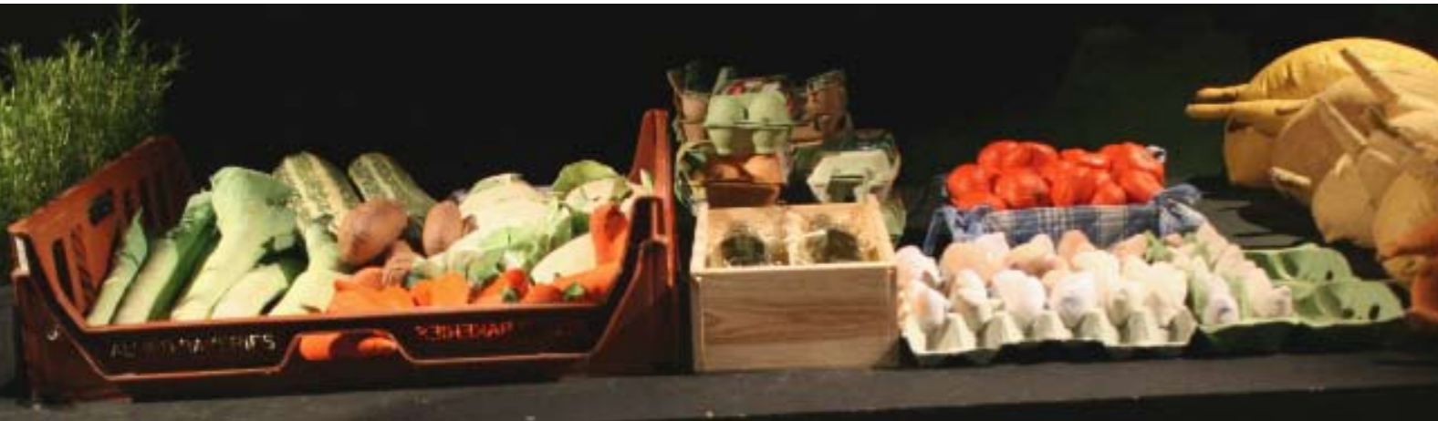
Above: An abundance of cloth objects; right: The Letter Shop and the Millinery Department

To book, please email us on events@bigwidetalk.org , or call 01223 364727 .