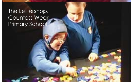
The Lettershop, Countess Wear Primary School

'Countess Chestnut Country Market' (2 weeks) Venue: Countess Wear Primary School , Exeter Funding Partners: Devon County Council 431 children, 152 adults