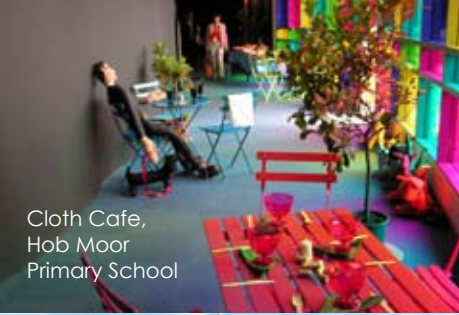
Cloth Cafe, Hob Moor Primary School

'Going Up Going Down' (2 weeks) Venue: Hob Moor Primary School , York Funding Partners: Hob Moor Asset Club; York City Council 943 children, 406 adults