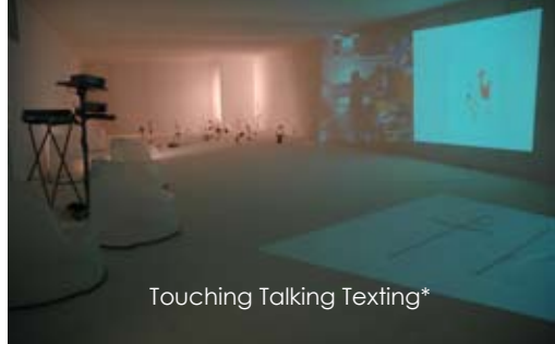
Touching Talking Texting*

'Touching Talking Texting' (2 days) & 'The Avonmouth Clothplace' (1 week) Venue: Avonmouth Community Centre , Bristol 400 children, 300 adults