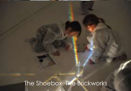
The Shoebox, The Brickworks

'The Colourbox' (2 weeks) Venue: The Brickworks, Manor Community College , Cambridge Funding Partners: University of Cambridge Office of External Affairs and Communications; the Institute of Physics 1502 children, 627 adults