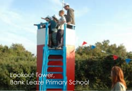
Lookout Tower, Bank Leaze Primary School

'Looking Out Looking In' (2 weeks) Venue: Bank Leaze Primary School , Bristol Funding Partners: Avonmouth Asset Club; Bristol City Council & 'Enabling Achievement: Parents make it happen' (1 day) Venue: Freshways Family Resource Centre, Bristol 958 children, 287 adults