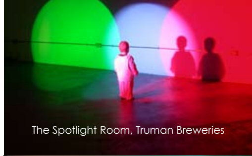
The Spotlight Room, Truman Breweries

'Exhibition Expedition' (2 days) Venue: Truman Breweries , Brick Lane, London Funding Partners: The Gatsby Charitable Foundation; European Union ESF 151 children, 122 adults