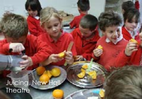
Juicing, New Hall Theatre

'Tiverton Talks' (3 weeks) Venue: New Hall Theatre , Tiverton Funding Partners: Tiverton Learning Community; Devon County Council; Mid Devon District Council; Tiverton Children's Centre 1500 children, 350 adults