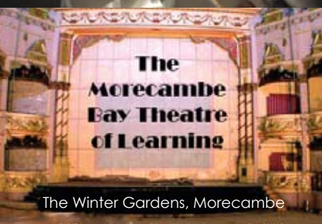
The Winter Gardens, Morecambe

'The Morecambe Bay Theatre of Learning' Venue: The Winter Gardens , Morecambe Funding Partners: Big Lottery Fund (November/December 2009)