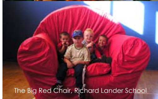
The Big Red Chair, Richard Lander School

'Our New School' (2 weeks) Venue: Richard Lander School , Truro Funding Partners: Cornwall County Council; Cornwall Children and Young People's Partnership 2500 children, 900 adults