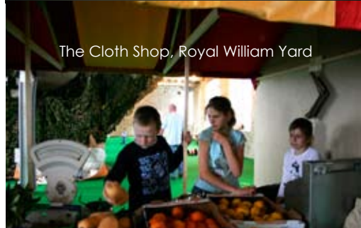
The Cloth Shop, Royal William Yard

'Looking Lighting Learning' (2 weeks) Venue: Royal William Yard Cooperage , Plymouth Funding Partners: Urban Splash; South West Regional Development Agency; Plymouth City Council; Torbay Council & 'Looking again Lighting Again Learning Again' (3 days) Venue: The Guildhall , Plymouth Funding Partners: Plymouth City Council 1500 children, 840 adults