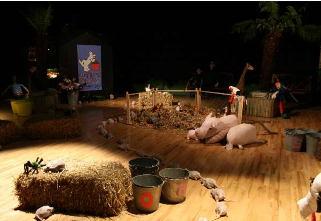
Cloth Place Farmyard

Big Wide Talk is therefore seeking local partnerships to realise this ambition. We have the support of the City Council, the County Council, many local schools and parents groups, as well as leading politicians including David Howarth and Ed Miliband, the Secretary of State for Energy and Climate Change.